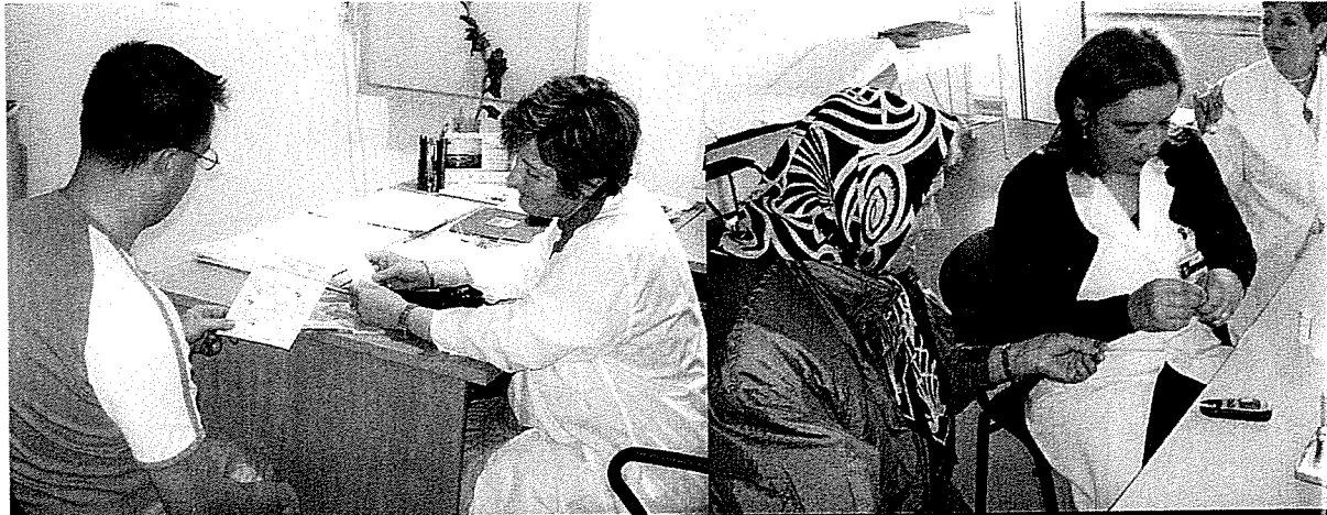
Counselling and specialty care has become more accessible to many of the patients in the Canton Sarajevo.

The new counselling site opened in May 2007 and is staffed by a family medicine doctor and nurse who received additional training in counselling, adult and child education, and diabetes technical skills. The Centre was equipped with educational materials, glucometers, testing strips and books donated by Roche and Oktal Pharma. Using a patient appointment system, individualized attention is given to assisting patients and their families with insulin injection techniques and use of the blood glucose meter, individualized diabetes meal planning, and other special needs. The centre is also organizing patient support group sessions.