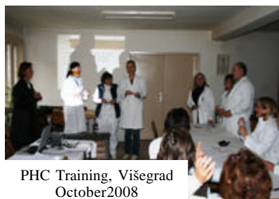
PHC Training, Višegrad October 2008

From June 2008 to November 2008, 15 training sessions for 270 participants were delivered. About 81% of providers trained were women reflecting an increasing number of women in BiH entering the medical profession, as well as the fact that women traditionally occupy the nursing profession.