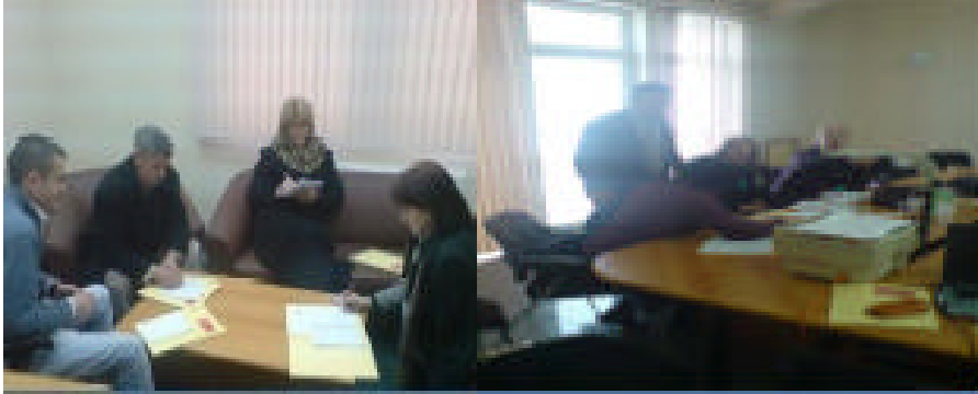
Kosovo mental health trainings